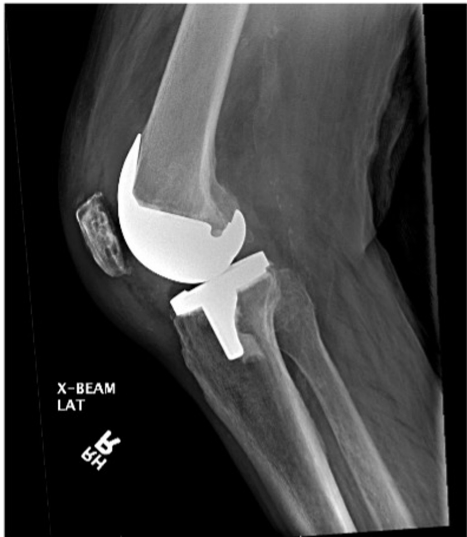
FIGURE 2: Lateral radiograph of the right knee in a patient presenting with acute crystal-induced arthritis.

The patient subsequently underwent synovial fluid aspiration, was admitted to the internal medicine service with an infectious disease on consult, and started on intravenous antibiotics. Blood cultures were pending. Initial synovial fluid from the right knee showed mucoid straw-colored fluid with 72,320 per cubic mm white blood cells, 99% neutrophils, 11,520 per cubic mm red blood cells, and no organisms. Based on these findings, prosthetic joint infection was the leading diagnosis and the patient was boarded for surgery.