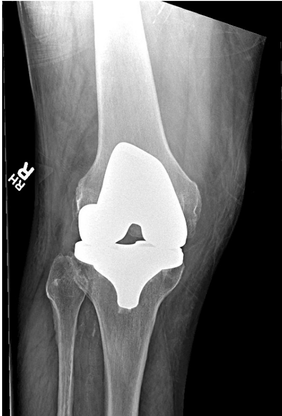
FIGURE 1: Anteroposterior radiograph of the right knee in a patient presenting with acute crystal-induced arthritis.