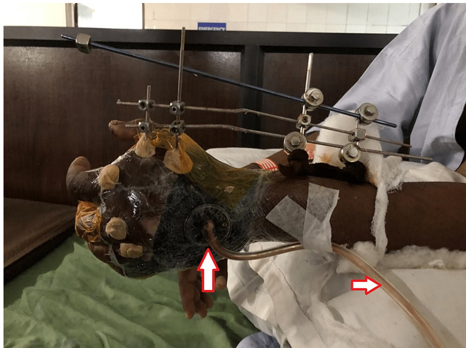
FIGURE 3: Vacuum-assisted closure (VAC)

The implant seen is a JESS (Joshi's External Stabilization system) fixator