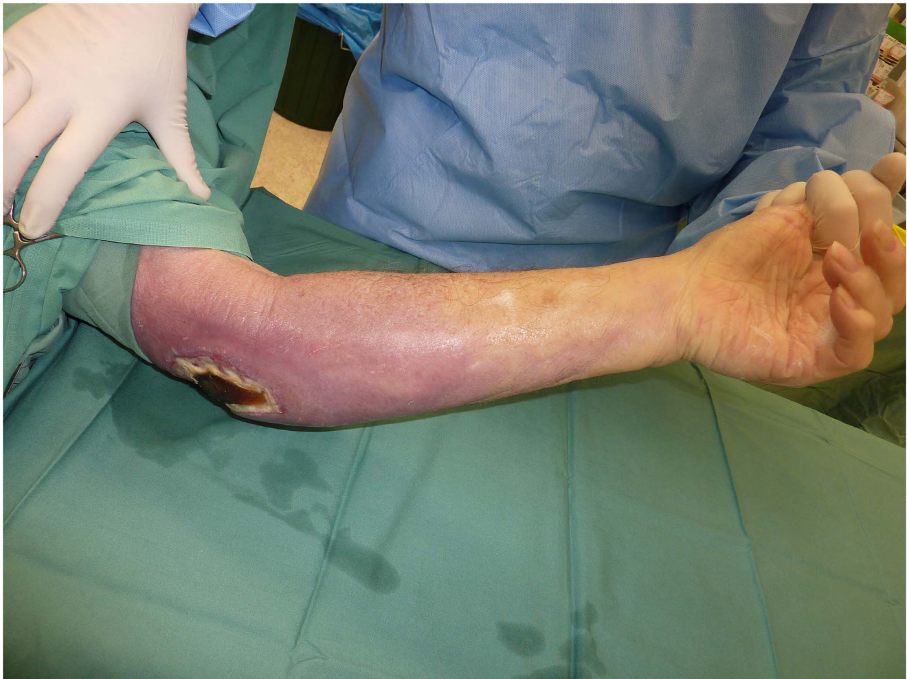
Figure 3. Oedematous M. ulcerans lesion of left elbow region showing necrosis.