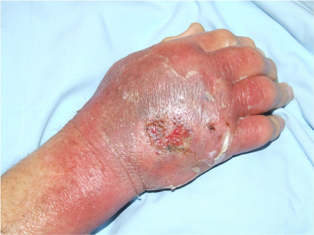
Figure 2. Oedematous M. ulcerans lesion dorsum of left hand. doi:10.1371/journal.pntd.0002612.g002