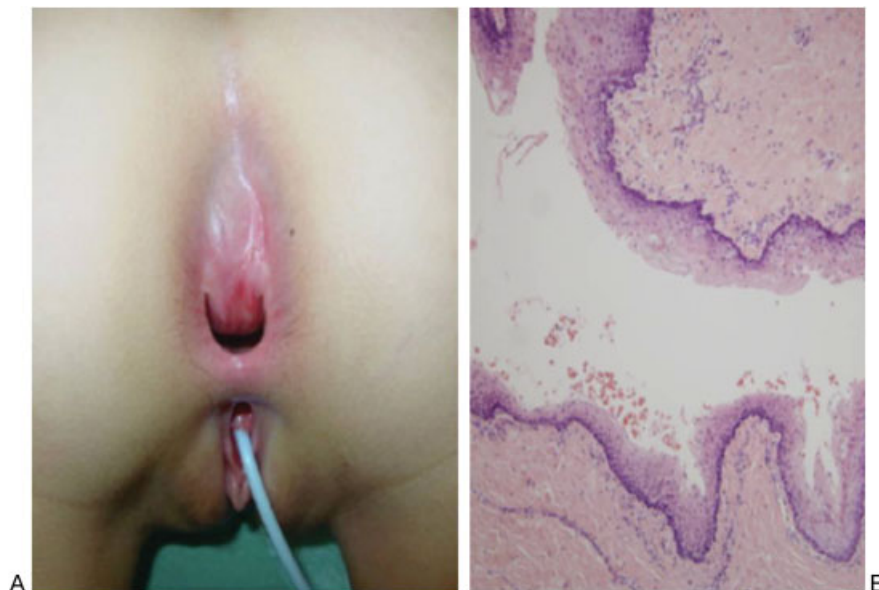
Fig. 2 (A) Rubberly mass in the retrorectal space in the sagittal posterior approach. (B) Histologic examination of the luminal surface of the cyst with columnar epithelium (hematoxylin-eosin 150X).

Tailgut cyst is a rare congenital lesion. In the course of normal development, the embryo forms a true tail at approximately 28 to 35 days of gestation. The embryonic hindgut extends into the tail, constituting the tailgut or postnatal gut, which undergoes regression by the 8th week of gestation. The persistence of the tailgut may remain and lead to the development of tailgut cyst. 4,7,8 They are defined by their histologic components and retrorectal location, lying anterior to the sacrum and posterior to the rectum.