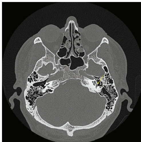
Figure 1. CT scan (axial plane) of patient (S5) shows left sided fenestral otosclerosis (yellow arrow: left sided fenestral involvement).

A comparison of the PTA scores (dB) before and after the implantation had revealed that the scores were significantly lower after the surgery. While the pure tone thresholds were between 30 dB and 50 dB, discrimination scores were between 70%–90% in the postoperative period [median PTA scores were 100 dB (range, 90–110) and 43 dB (range, 30–50) before and after the implantation, respectively, P = 0.002 ; median discrimination scores were 16% (range, 12%–20%) and 82% (range, 70%–94%) before and after the implantation, respectively, P = 0.002 ].