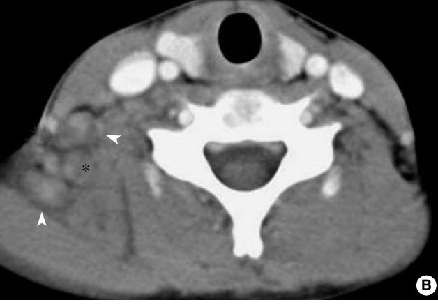
Fig. 1. A 12-yr-old boy with fever and cervical lymphadenopathy. Axial CT scans of the neck show multiple, small- and medium-sized lymph nodes in both submandibular regions (levels IA) (arrows) and on the right side of the neck (level V) (arrowheads). Note the ring-shaped nodular necrosis (*) on the right side of the neck as well as the adjacent perinodal infiltration.