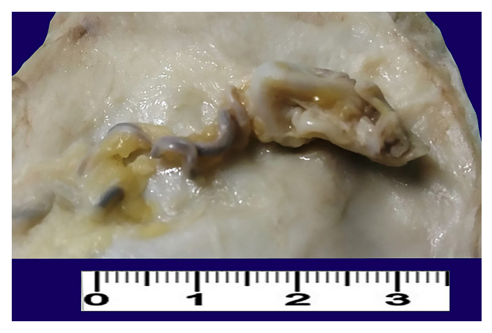
Figure 2. Large-Caliber and tortuous artery in the formalin-fixed serosa of the stomach.