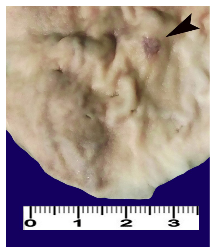
Figure 1. Gross view of the formalin-fixed gastric mucosa showing erosion measuring 3 mm in the gastric mucosa (arrowhead).

The remaining organs presented hypertrophic cardiomyopathy and bilateral benign nephrosclerosis, the heart weighed 490 grams (mean reference value [mRV]; 280g) and the kidneys 130 grams/each on average (mRV for both 240-350g), which corroborated