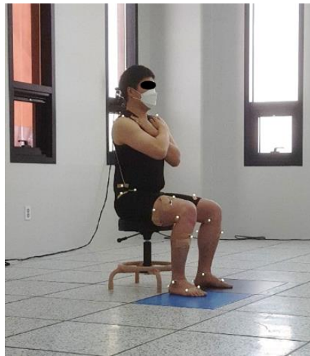
Figure 1. Experimental preparation posture.

were conducted in a random order. A card with the experimental conditions was placed in a sealed envelope, and the experiment was conducted in the order in which each participant drew the card. The participants performed the sit-to-stand motion under each condition, and the biomechanical variables were then measured (Figure 2). To increase reliability, three successful measurements were taken for each condition, and the average value was used for analysis. All participants performed the sit-to-stand motion a total of nine times. The test was considered successful if all markers were visible and the EMG signals of all muscles were recorded correctly. There was a one-minute rest period between each test and a five-minute rest period between the lumbar belt conditions.