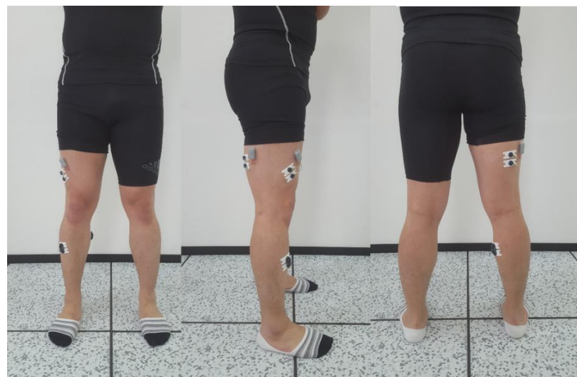
Figure 3. Attachment of EMG electrodes.

We measured the muscle activity of the vastus lateralis (VL), biceps femoris (BF), tibialis anterior (TA), and gastrocnemius (GM) muscles during the sit-to-stand motion using the Wireless Bipolar Cometa Mini Wave Plus EMG system (Cometa, Bareggio, Italy) synchronized with Visual 3D software (C-Motion). The sampling rate of the surface EMG signal was set to 2000 Hz. The raw surface EMG signal was rectified after band-pass filtering at 10–1000 Hz and low-pass filtered with a Butterworth filter [39]. As the ground electrode, a disposable anode surface electrode made of silver–silver chloride was used and attached parallel to the muscle fiber. The distance between electrodes in the surface EMG was set to 20 mm. To minimize the skin resistance and reduce the noise of muscle activity measurement, the hair on the skin was removed using a disposable razor, and after gently polishing with sandpaper, the skin was cleaned with alcohol. After the electrode attachment site was dried, two active electrodes and a reference electrode were attached. The electrodes of the four muscles of the dominant lower extremity (VL, BF, TA, GM) were placed according to the SENIAM guidelines [40] (Figure 3).