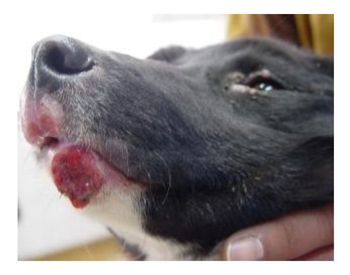
Fig.1: Skin lesions in the chin and mucocutaneous junction of the lips