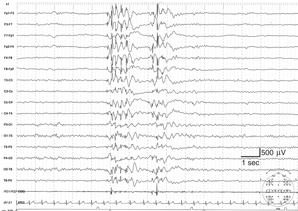
Fig. 1. Ictal EEG recording during eyelid myoclonia shows 4- to 5-Hz generalized polyspike-waves preceded by focal frontal discharges.