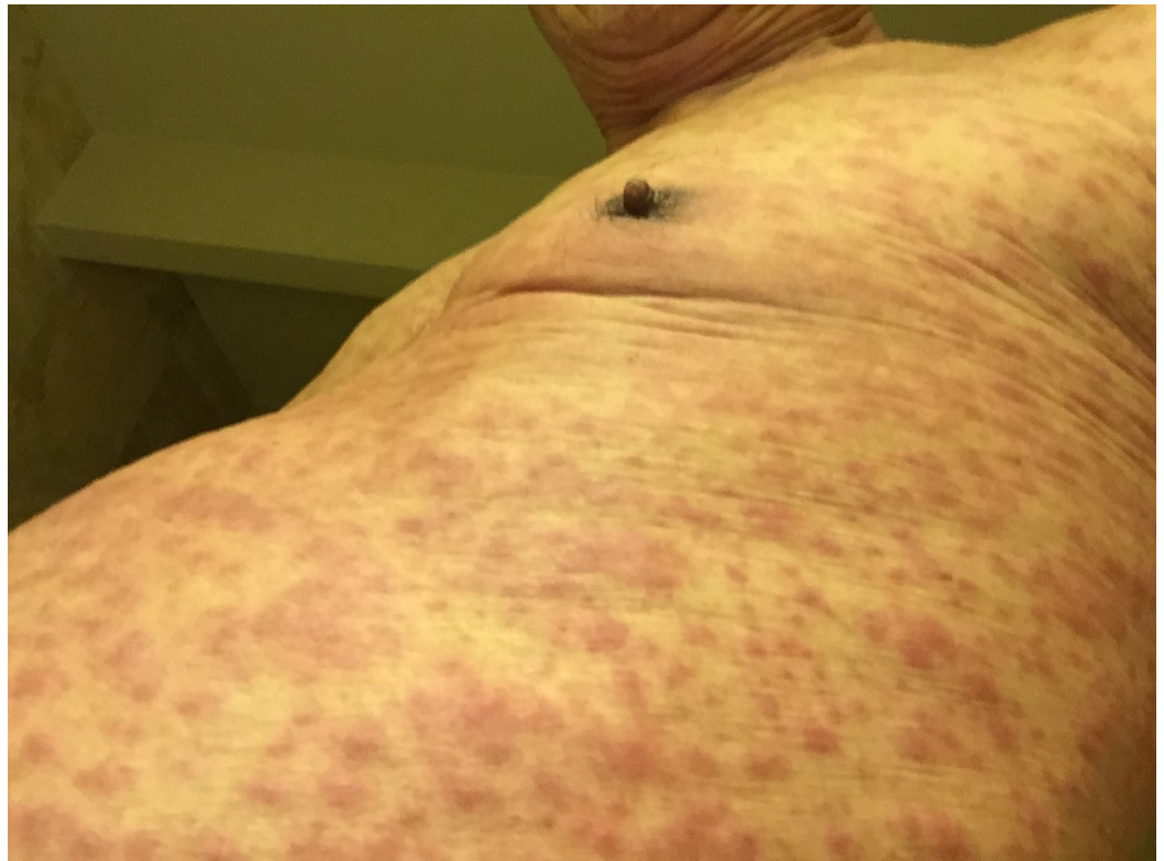
FIGURE 2: Trunk four days after influenza vaccination

Diffuse presentation of coalescing macules across the trunk. Lack of serious skin detachment.