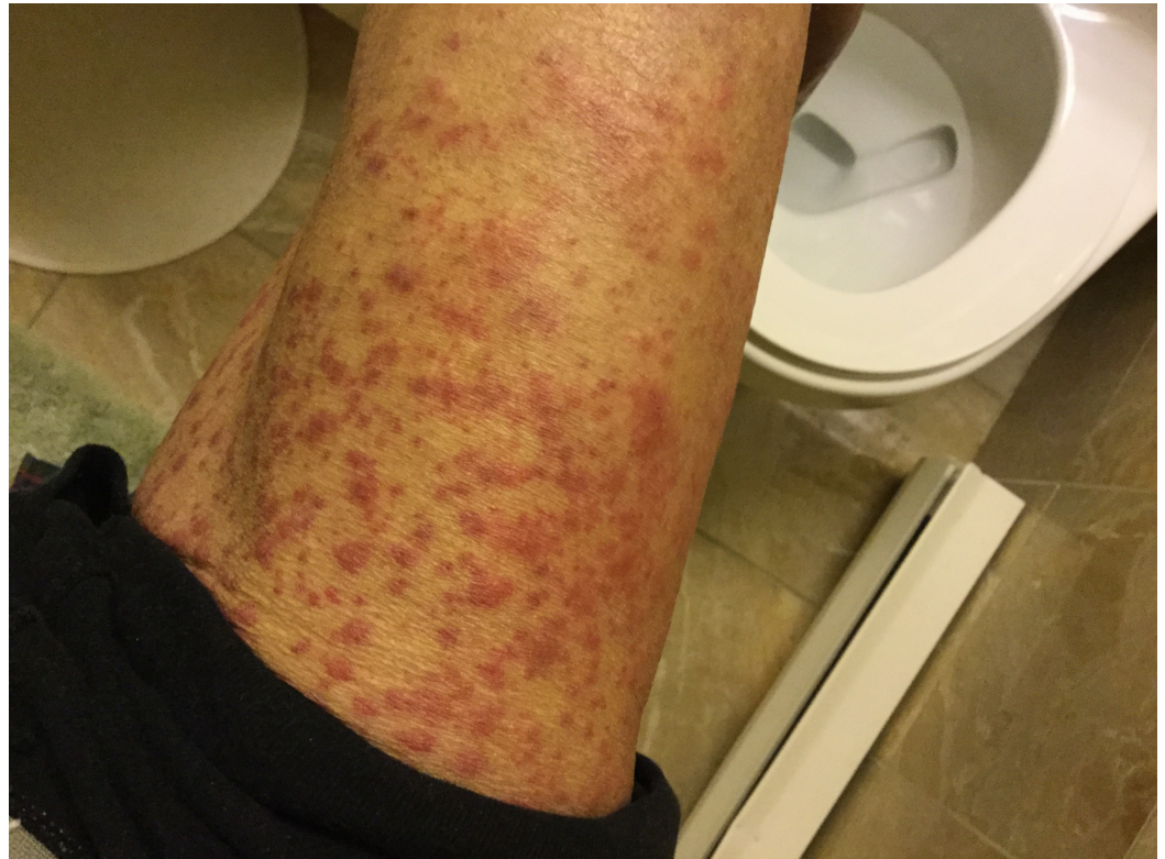
FIGURE 1: Thigh four days after influenza vaccination

morbilliform rash on his body that had spread to the patient's face. He was admitted to the hospital for two nights. A dermatologist verified the diagnosis of SJS and prescribed cetirizine (10mg daily for seven days). The patient had an estimated 85% body surface area affected with a SCORe of Toxic Epidermal Necrosis (SCORTEN) score of 1 [1]. Oral steroids were suggested, but the patient declined to take them. One day after discharge (eight days after the influenza vaccination), he noted the appearance of more ulcers on his bottom lip (Figure 3). Nine days after the influenza vaccination, he saw another dermatologist who recommended an oral mouthwash for symptomatic relief. Gradually, the skin rash improved, but the oral ulcers worsened until about nine days after vaccination and improved by 13 days after vaccination. The patient felt he was mostly recovered about a month after the vaccine. Other than the flu vaccine, patient had not taken any new medications, new supplements, or new foods prior to the development of the itching and skin rash.