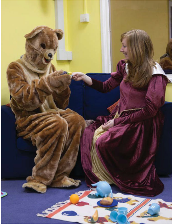
Figure 1 Birthday lady and teddy bear.