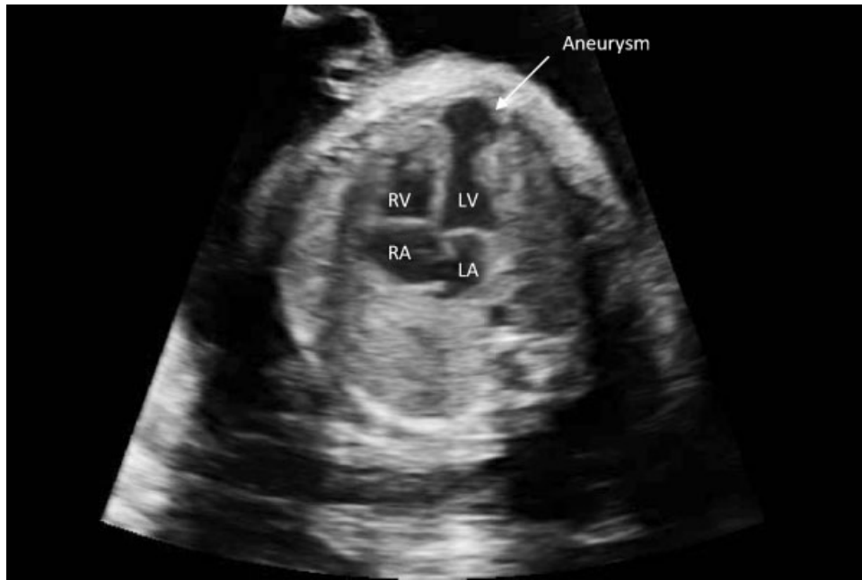
Figure 1 Abnormal four-chamber view on ultrasound demonstrating the left ventricular aneurysm. LA, left atrium; LV, left ventricle; RA, right atrium; RV, right ventricle.

transthoracic echocardiogram confirmed the diagnosis of left ventricular aneurysm and demonstrated otherwise normal intracardiac anatomy. To demonstrate the akinetic segment of the aneurysm, we utilized tissue Doppler imaging (TDI), illustrating a color-coded measure of myocardial velocity. Figure 2 demonstrates the normal myocardial velocity across the left ventricular wall (represented by the yellow and aqua colors), as well as the akinetic segment in the aneurysm (represented by the red, green, and orange colors). The TDI myocardial velocity in the normal myocardium was significantly different compared with the velocity in the akinetic aneurysm.