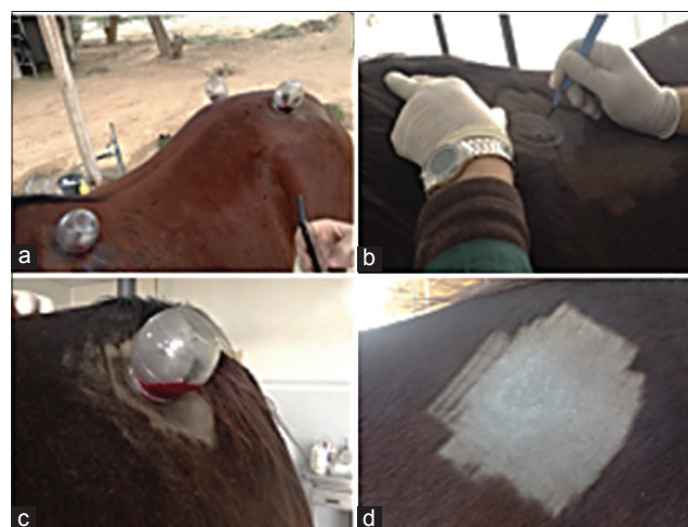
Figure-1: (a) Image showing the position of cupping in horses two places located behind the shoulder (left and right) and the other two places located on the rump (left and right) in the level of sacrum; (b) Uses a blade to make some superficial incisions on cupping areas; (c) Bleeding in progress into the glass cups after incising the skin with a blade. (C and d) Place of wet cupping therapy (7 days after cupping procedure).