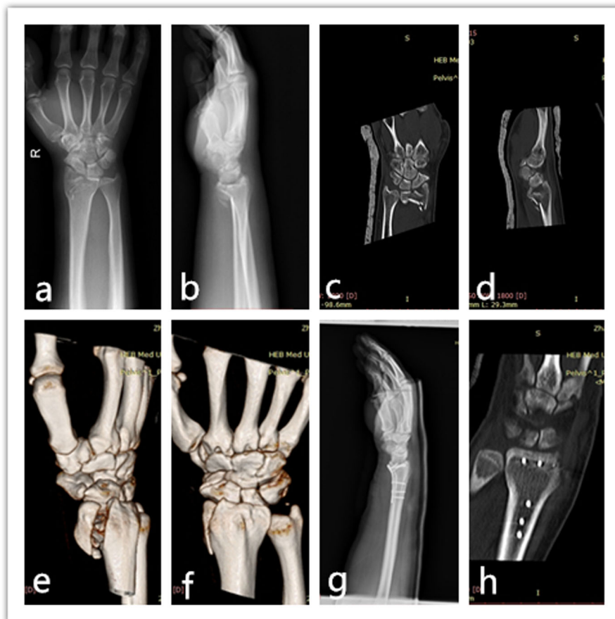
Fig. 1 Patient, male, 39 years old, suffered from motor collision accident and sustained fracture in his left wrist. The preoperative radiographs (a, b) and CT scanning (c–e) showed the fracture of lunate facet with slight subsidence; and the fracture line extended to metaphysis. He underwent external fixation treatment (f–h) and the CT scanning showed the favorable wrist joint congruence

For the die-punch fracture with slightly impacted fragments, continuous slight traction was performed to achieve and maintain the reduction under fluoroscopic guidance. Then, the external fixator (Stryker Trauma Corporation, Swiss) was directly fixed on the radius and the second or third metacarpal bone, with 4-mm Schanz pins and 3-mm pins applied respectively (Fig. 2). For fractures that were unsatisfactorily reduced or with the significant articular surface collapse or significant displacement of the larger fragment, a small incision was made at the volar side of the distal radius and the periosteum elevator was introduced to elevate the collapsed fragments. In cases of bone defect or seriously impacted fragments, allograft or allograft bone was implanted. After confirmation of the reduction under the fluoroscopic control, additional K wires were inserted for auxiliary fixation, if needed. All ulnar styloid fractures were not treated specially.