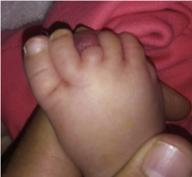
Fig. 1. Edema and swelling of the toe due to hair strangulation (Patient 13).