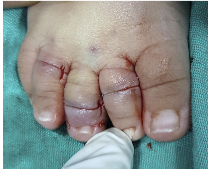
Fig. 2. Appearance of the toes after the removal of hair (Patient 4).

gender, affected fingers or toes and the affected sides of the patients and the duration of symptoms until presentation were recorded (Table 1).