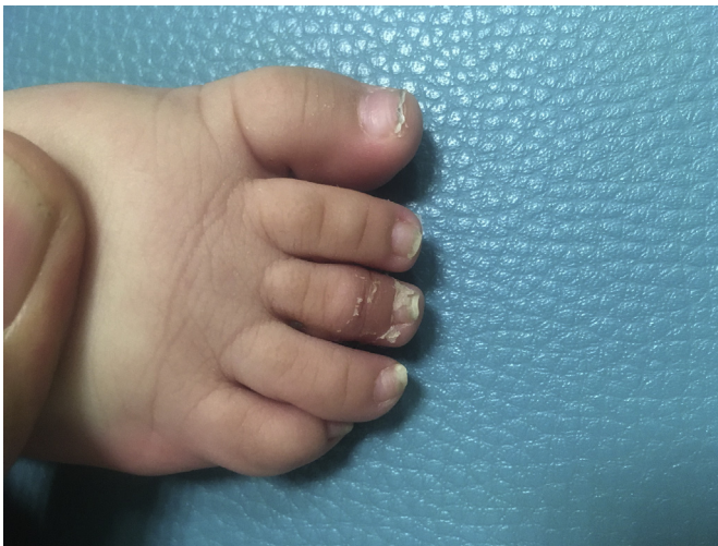
Fig. 4. Healed toe 15 days after the removal of hair (Patient 13).

affected appendage. However, the condition could as well be seen in the fingers, genitals or the uvula. 6–8 There is no information about the side of the toes mostly affected, but in our series, the right side was statistically significantly higher ( p = 0.019 ). HTS is an emergency situation and the removal of hair or thread should be done as soon as possible.