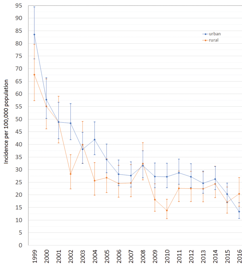
Figure 3. Adjusted annual incidence trends of inflammatory bowel disease by urban-rural location in Saskatchewan, Canada.

an increasing incidence trend in the past 9 years for ages 30 to 60, and a stable trend in other age groups (18). Clearly, these studies indicate variations in IBD rates across Canada which