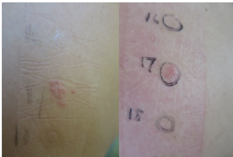
Figure 3. Patch test result after 96 hours, indicating the presence of erythematous papules following exposure to cobalt (left sided) and nickel (right sided).

skin, general symptoms are also occasionally observed. Clinical manifestations of this condition may include dermatitis in areas of previous exposure (flare up of previous dermatitis and positive patch test sites), dermatitis on previously unaffected skin (vesicular hand eczema, flexural dermatitis, baboon syndrome, maculopapular rash, and vasculitis-like lesions), as well as general symptoms (headache, malaise, arthralgia, diarrhea, vomiting, and fever). [2,4] Baboon syndrome has been used to refer to SCD manifesting as well-demarcated eruptions on the buttocks, in the genital area, or as a V-shaped lesion on the inner thighs with colors ranging from dark violet to pink. Vesicular hand eczema (pompholyx or dyshidrotic eczema) manifests as pruritic eruptions on the palms, volar regions, sides of the fingers of the hand, and occasionally the plantar aspects of the feet, in the form of deep-seated vesicles with sparse or no erythema. Recurrent vesicular hand eczema, as well as erythema or a flare of dermatitis in the elbow and/or knee flexures are also commonly observed in SCD. Moreover, nonspecific maculopapular rashes may also often be a part of an SCD reaction. [2,6]