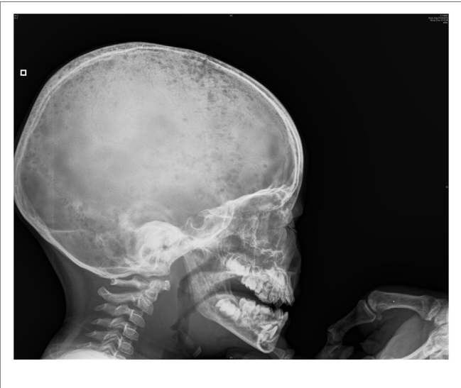
FIGURE 1 | Skull radiograph – multiple lytic areas.

His clinical evolution was marked by two complications. In the second week of hospitalization, he developed severe abdominal pain with increases in levels of pancreatic enzymes (hypercalcemia-induced pancreatitis). One week later, he refused to walk, with progressively increasing bilateral knee pain. Full-skeleton radiography showed supplementary lytic lesions involving the skull ( Figure 1 ) and knees, with bilateral distal femoral fractures