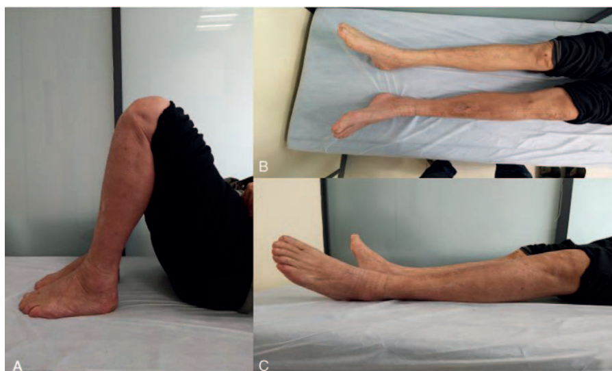
Figure 9. Photograph of the knee joint in (A) flexed and (B, C) extended positions.

rotational displacements. Furthermore, because the injured limb cannot be moved easily, the surgical incision and approach are often limited.