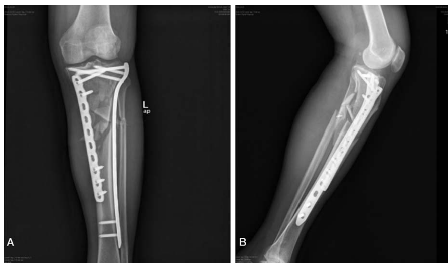
Figure 6. X-rays of tibial plateau obtained 3 d after operation. (A) Frontal view and (B) lateral view.

An x-ray obtained 2 months postoperatively demonstrated the joint space and articular surface to be in satisfactory condition (Fig. 7). There was obvious absorption of some of the fracture fragments of the tibial plateau and blurring of the fracture lines (Fig. 8). Recovery of knee joint function was satisfactory. Range of motion of the knee joint was -5^{\circ} to 120^{\circ} , and the Hospital for Special Surgery (HSS) Knee Score was 100 (pain, 30; function, 22; range of motion, 18; muscle strength, 10; flexion deformity, 10; and stability, 10) (Figs. 9 and 10).