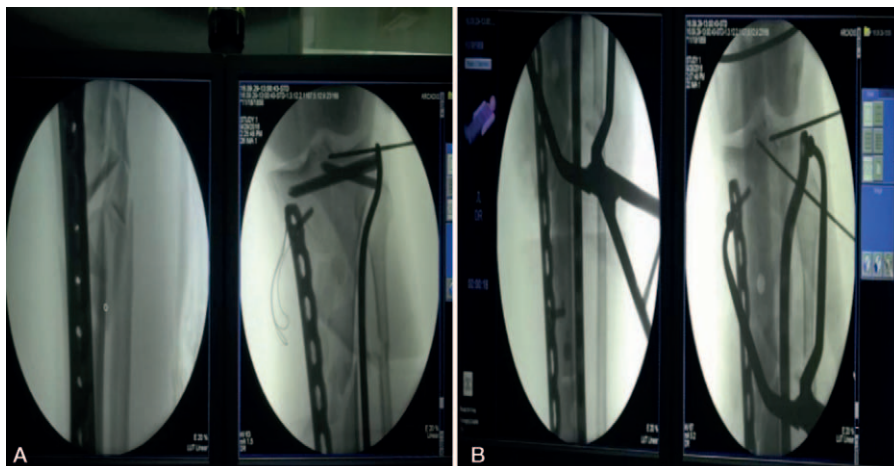
Figure 2. Intraoperative reduction (A) and radiologic information (B) of tibial plateau.

First, double reverse traction was applied, with the proximal pin in the distal femur and the distal pin in the calcaneus. A 2- to 3-cm incision was then made over the proximal aspect of the tibia medially and laterally, in accordance with the location of the fracture site and the use of double plates. A submuscular plane was created, and the plate was slid into the anterior submuscular plane and fixed with screws, which were inserted percutaneously through the primary surgical incisions. By employing less extensile exposure and the indirect reduction technique of double reverse traction and closed reduction combined with minimally invasive percutaneous plate osteosynthesis (MIPPO) technique, this severe comminuted fracture and tibial shaft