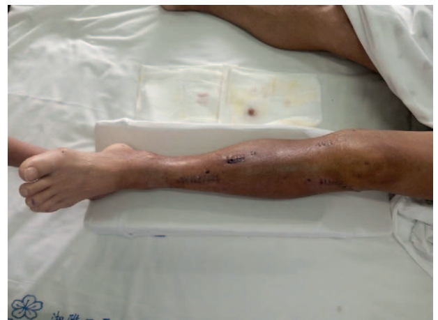
Figure 5. Photograph taken 1 wk postoperatively showing the entire lower limbs.