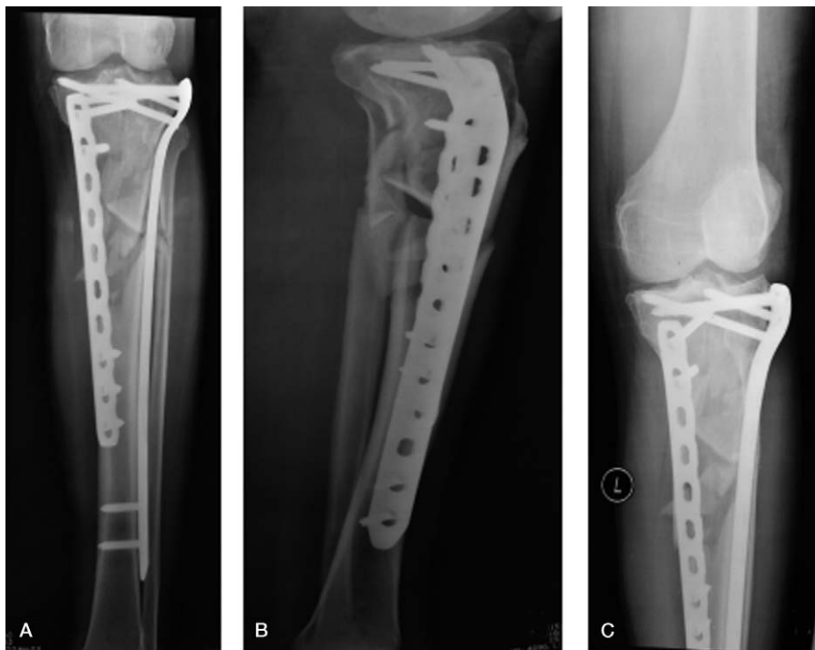
Figure 7. X-rays obtained 2 mo after operation. (A) Knee joint frontal view. Tibial plateau: (B) lateral view and (C) frontal view.