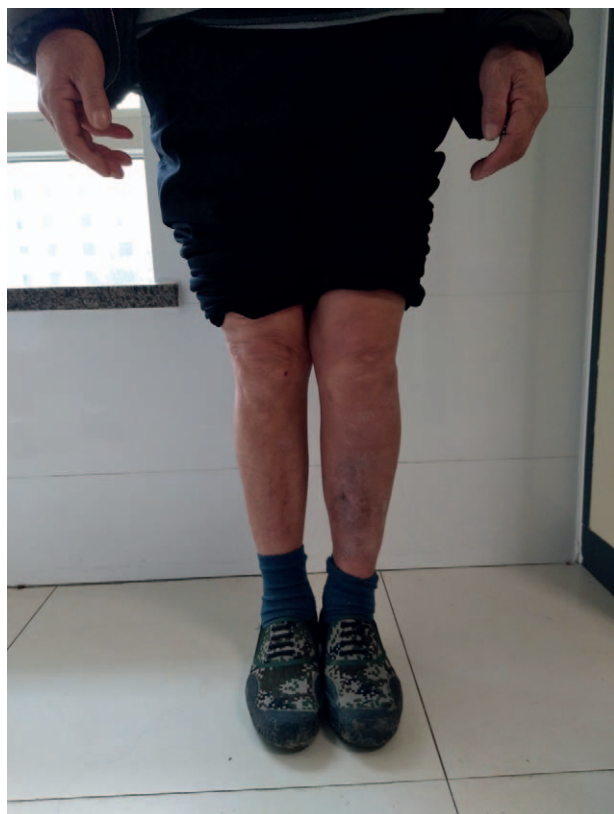
Figure 10. Photograph of patient in standing position.

Double reverse traction combined with MIPPO technique can reduce the risk of surgical complications, such as bleeding, oozing, and wound infection. It can be applied in patients with comorbidities such as cardiac disease, hypertension, and heart