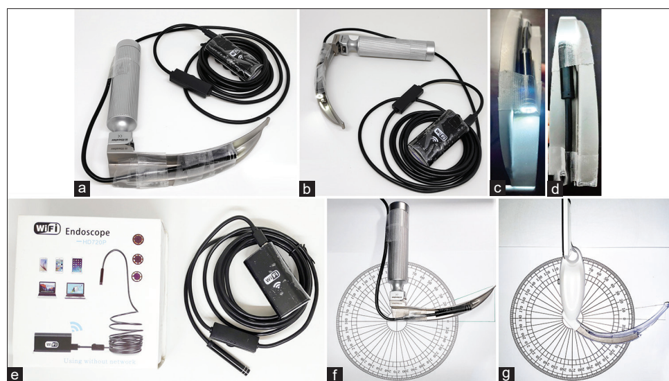
Figure 1: Self-made video laryngoscope used in this study. (a-d) Lateral and top view of the laryngoscope. (e) Portable video camera with a Wi-fi connection (Wi-fi Endoscope Video Camera model YPC99). (f and g) Comparison of the curve and angle of the scope (f) and McGrath MAC® Laryngoscope (g)

The group label was assigned using table randomisation within a sealed envelope. The groups were divided into the self-assembled modified Macintosh VL (SAM-VL) group or the McGrath MAC® VL (McGrath) group. The person performing the intubation or the airway operator was a first-year anaesthesiology resident who had a minimum of six months of basic airway management training using a Macintosh laryngoscope.