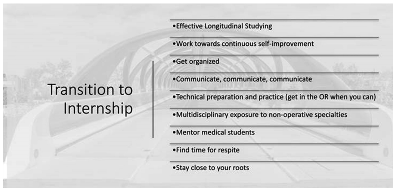
FIGURE 2. In conjunction with the Thoracic Surgery Residents Association, a committee of 8 residents who recently finished their internship at their respective I-6 programs were organized on a voluntary basis by senior trainees from both I-6 and traditional pathways, as well as an attending surgeon to identify core challenges related to transitioning from medical school to I-6 residency. OR , Operating room; I-6 , integrated 6-year.

on things that were learned, things that went well, and how to improve further. As you develop further and accumulate more autonomy in training and beyond, only you can establish and enforce your own standard. You must become your own toughest critic and coach.