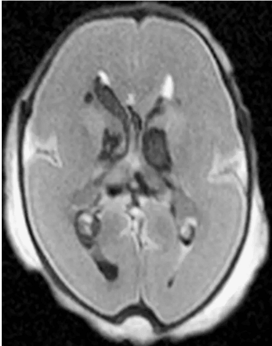
FIGURE 2: Axial T2-weighted postmortem MRI of brain in a 23-week fetus demonstrates bilateral intraventricular and periventricular hemorrhage.

One innovative clinical study described the accumulation of pleural fluid created as an image from PMMRI as being an important indicator of post-mortem diagnostics for pediatric patients [20]. The same study, however, found no similar relationship between perinatal deaths and stillbirths for unknown reasons [20]. Diffusion-weighted magnetic resonance imaging (DWI) with better models can also be useful in determining apparent brain diffusion coefficient (ADC) and degree of maceration during the gestation and post-mortem interval [21,22]. While PMMRI continues to be on the frontlines for increasing diagnostic capabilities, creating a cost-effective way to construct this apparatus so patients can have more accessible diagnostic tools in medical facilities throughout the nation could be pivotal.