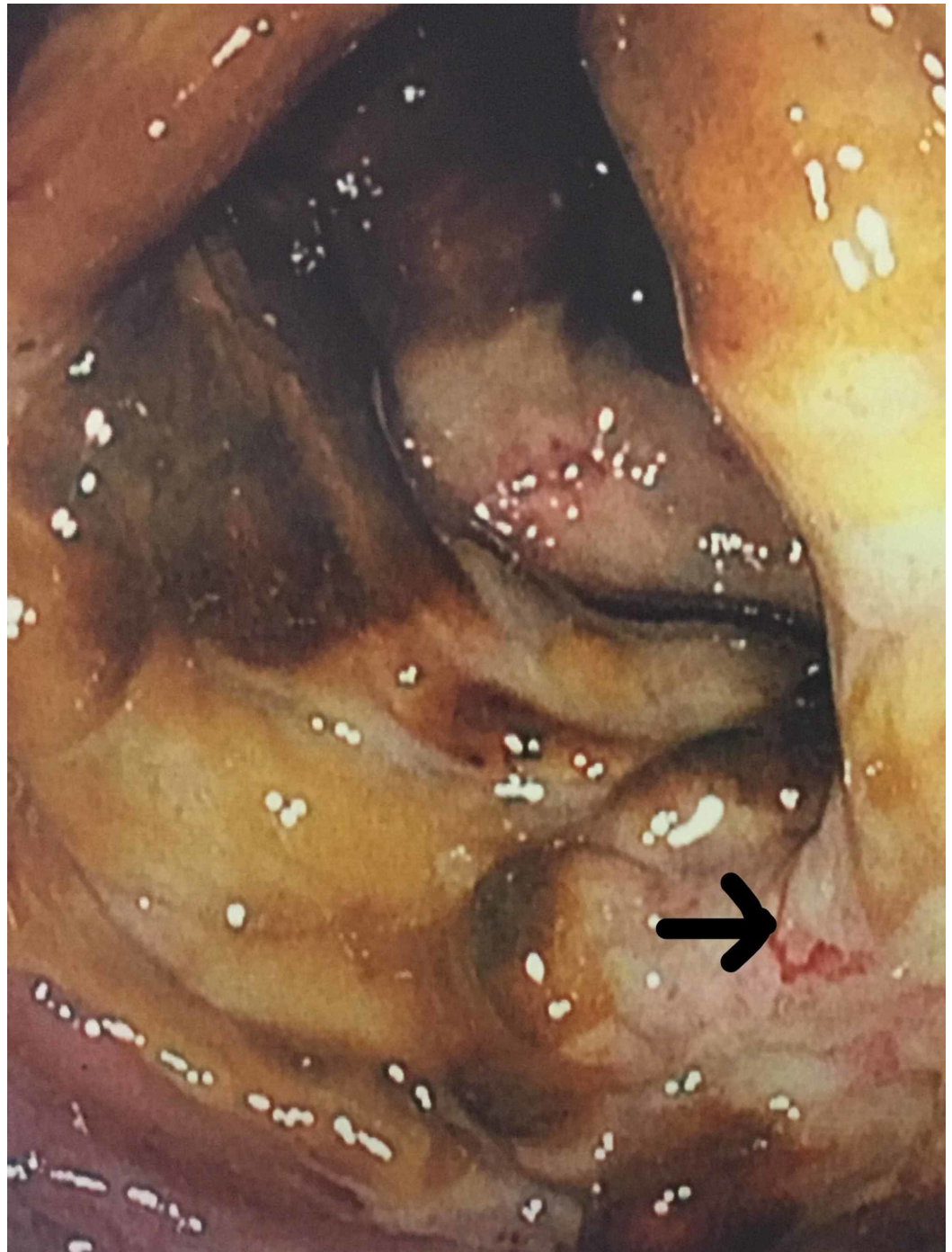
FIGURE 2: Ulcerated and necrotic cecum with areas of mucosal hemorrhage (arrow)

Biopsies of the cecum revealed inflammatory exudates as well as significant gangrenous necrosis consistent with ischemia. The colon was otherwise normal aside from mild sigmoid diverticulosis. Also obtained on Day 5 of admission was a duplex US of the abdomen, which was remarkable for a peak systolic velocity of 543 cm/s at the origin of the celiac artery, indicating high-grade stenosis. A peak systolic velocity of 805 cm/s at the origin of the SMA was seen, also indicating high-grade stenosis. The origin of the IMA was occluded but evidence of collateral vessel formation was identified distally. The peak systolic velocity at non-occluded portions of the IMA was 52 cm/s. Two days later, the patient underwent a mesenteric angiogram and