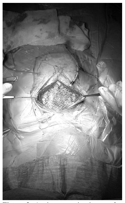
Figure 3. An intraoperative image of a complete sternal cleft. A prolene mesh was measured and placed above pericardium and attached to ribs with prolene sutures.