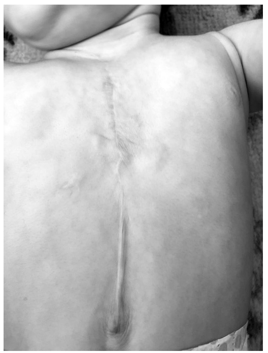
Figure 4. A postoperative image of sternum at six months.

and craniofacial hemangiomas. Our case had associated esophageal atresia and hydronephrosis. Sternal cleft, supraumbilical abdominal anterior wall defects, anterior diaphragm defect, pericardial defects, and intracardiac anomalies constitute the Cantrell pentalogy. Also, sternal clefts can be a part of posterior fossa brain malformations, hemangioma, arterial lesions, cardiac abnormalities, and eye abnormalities (PHACE) syndrome or Poland's syndrome consisting of hand anomalies, nipple anomalies, dextrocardia, renal agenesis, and various tumors.<sup>[5,6]</sup> Physical examination, echocardiography, and CT are helpful to define the anomalies and decide the surgical repair strategy. Newborn babies with a complete sternal cleft need to be hospitalized, since the membranous skin covering the defect leaves the heart unprotected and there is a risk for respiratory compromise.