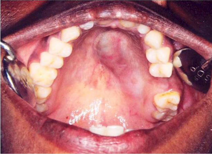
Figure 1: Intra-oral picture showing swelling extending from right central incisor to left second molar