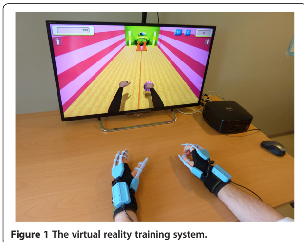
Figure 1 The virtual reality training system.

Patients in the control group receive individually tailored conventional training consisting of a self-training program under supervision of a therapist to match the therapy and intensity provided in the experimental group. Conventional arm training is based on a set of standardized exercises which comprise task-related practice for gross movements and dexterity including different grips and selective finger