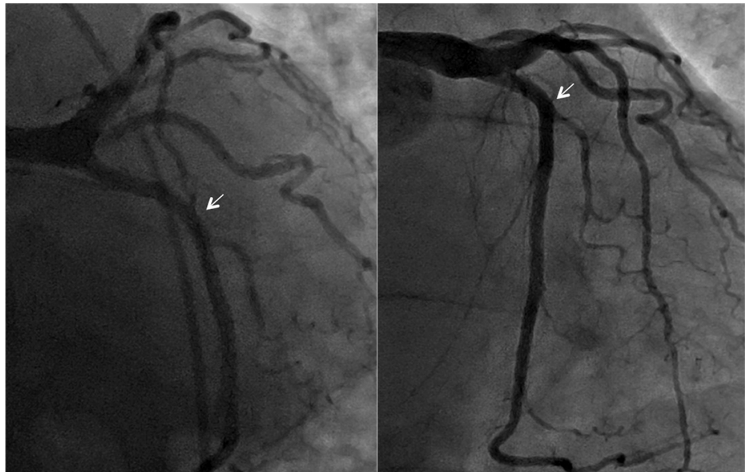
FIGURE 1: Preoperative coronary angiography showing no obstructive disease in the left circumflex coronary artery

Due to his recurrent chest pain, a repeat angiogram was done, which showed severe stenosis and distortion of the mid circumflex artery in close proximity to the suture line of the mitral ring (Figure 2A). The lesion was crossed with a 0.014" Runthrough wire with moderate difficulty (Terumo, Somerset, NJ). Optical coherence tomography (OCT) was then performed with a Dragonfly OPTIS imaging catheter (St. Jude Medical, Minnesota, United States) and showed no significant atherosclerosis in the circumflex artery but a severe iatrogenic stenosis of the mid segment of the artery (Figure 2A'). The lesion was dilated with a 2.5x12 mm Sprinter RX balloon (Medtronic, Minnesota, United States) and stented with a 3.5x15 mm Xience stent (Abbott Vascular, Santa Clara, CA) (Figure 2B). Post-stenting angiography and OCT imaging demonstrated complete resolution of the stenosis and a well-apposed stent (Figure 2B').