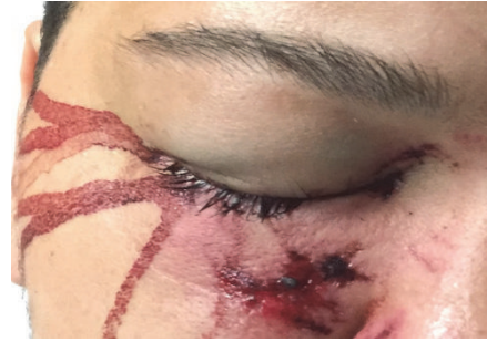
FIGURE 1: Patient presentation after reported right eye injury from a thrown rock.