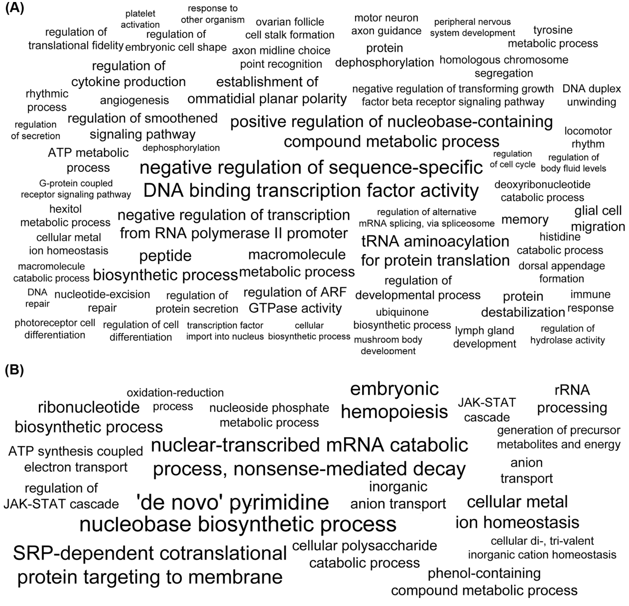
Fig 3. Term cloud of over-represented Gene Ontology terms among positively selected genes (PSGs). (A) GO biological processes over-represented among PSGs in the Hexapoda lineage and (B) in the Collembola lineage. The size of the GO terms is proportional to the p -value obtained in the enrichment test [75], enriched terms were summarized and redundancy was removed with the REVIGO tool [76] using a semantic similarity threshold of 0.7 and D. melanogaster GO Database as reference. The complete dataset of GO enriched terms is presented in the <u>S4 Table</u>.