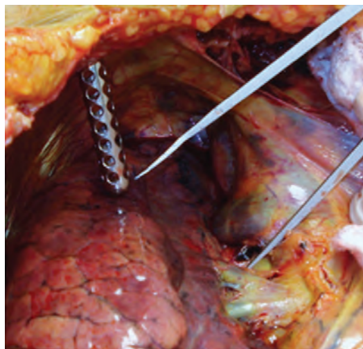
Figure 3 - Distance from the distal end of the chest tube to the right upper lobe artery.