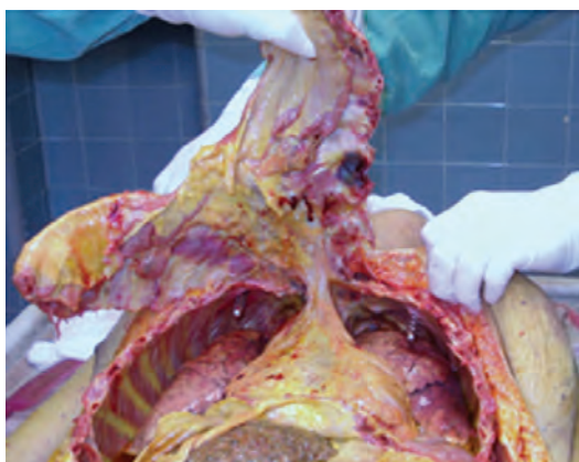
Figure 1 - Resection of the anterior ribs.

Table 1 shows that the mean weight of the operated cadavers was 68.6 \pm 2.1 kg, and the median weight was 66.5 kg. The mean height was 1.70 \pm 0.02 m, and the median height was 1.70 m. The mean posteroanterior diameter of the chest was 29.4 \pm 2.8 cm, and the median