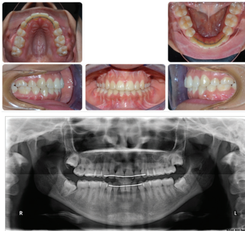
Figure 5 - Photographs and orthopantomogram from the 18-month follow-up.