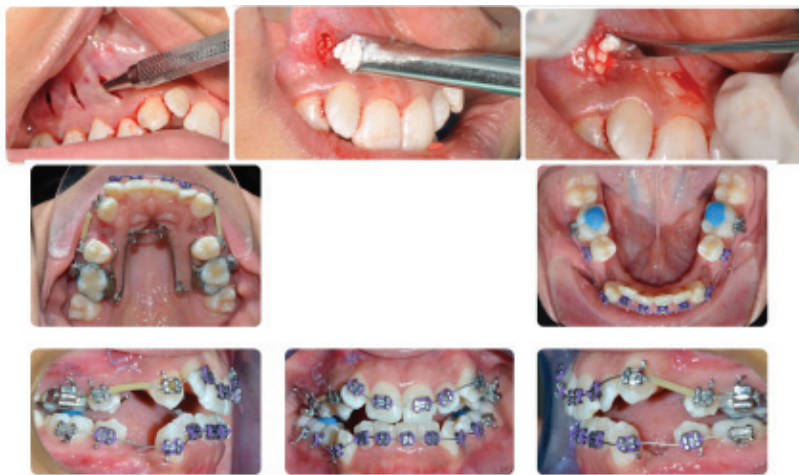
Figure 2 - Minimally invasive corticotomy (piezo-surgery) with bone graft on the buccal side of the right upper arch (from the distal of UR 7 to the mesial of UR3). One week later, cementation of the expanded quad helix and bonding the upper and lower teeth (6-6) with pre-adjusted edgewise-fixed appliances (0.018" × 0.025" slot Roth prescription) was performed. Upper and lower 0.014 NiTi aligning arch wires were placed.