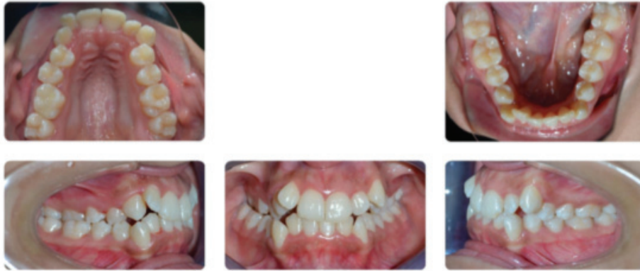
Figure 1 - Initial intra-oral photographs of the patient (note the unilateral asymmetry of the upper arch)