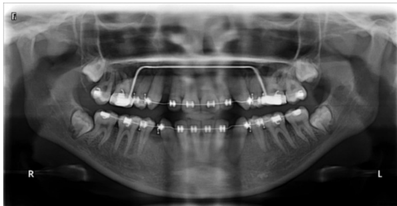
Figure 3 - Tipping of the lower canines was noticed and an orthopantomogram was obtained. The lower canines' apices were displaced mesially while the crowns tipped distally. A consultation was made with the periodontist to perform piezocision around the apices of the lower canines.