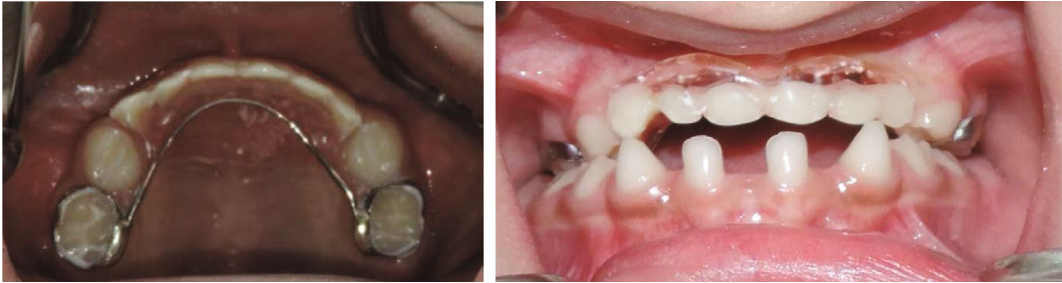
FIGURE 3: Modified fixed Nance appliance with artificial anterior teeth.