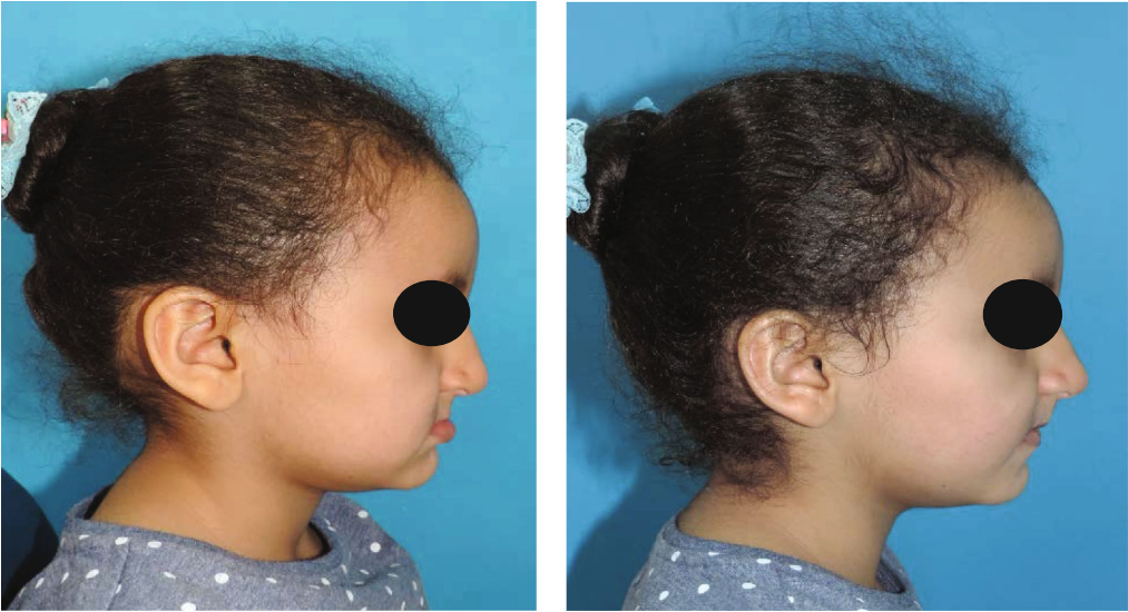
FIGURE 4: Pretreatment and postplacement of the appliance showing definite improvement in the patient's profile.