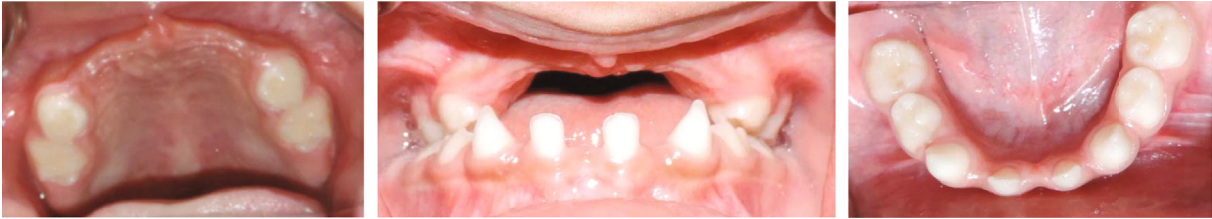
FIGURE 1: Intraoral pictures demonstrating multiple missing teeth.