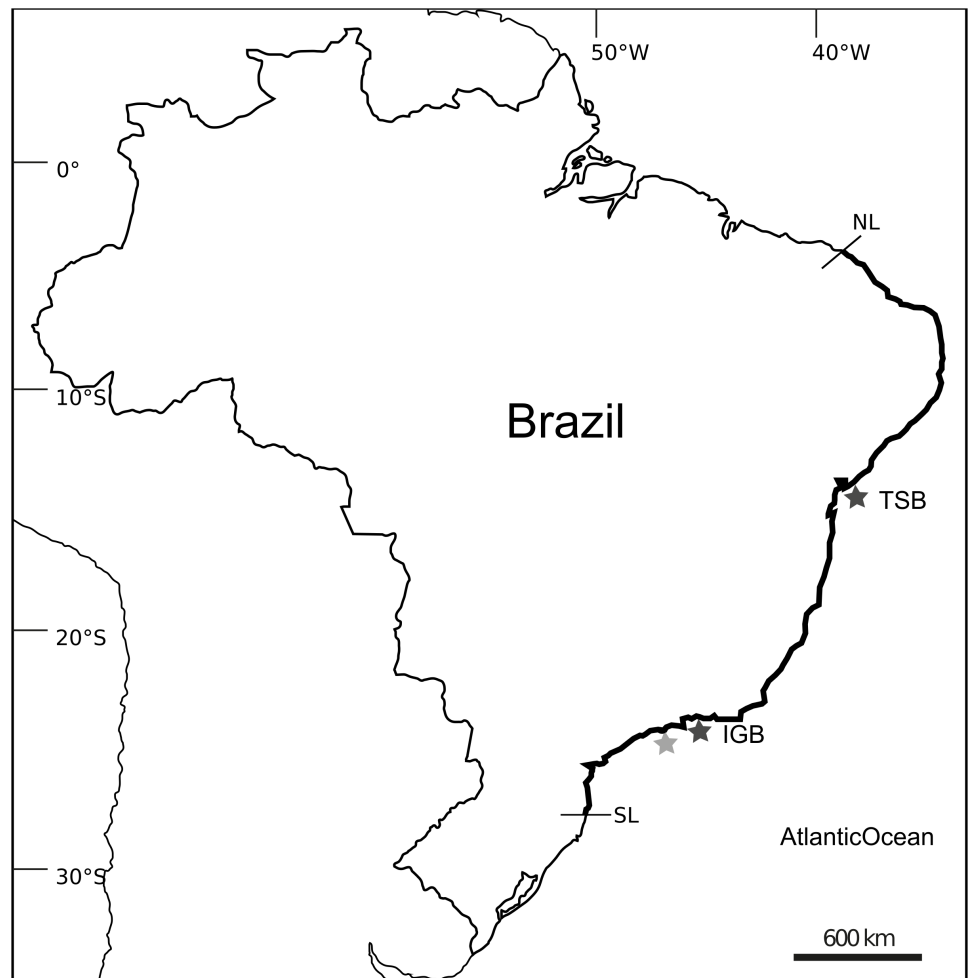
Figure 1 Distributional range and sample localities on Southwestern Atlantic. Map showing the distributional range of Tubastraea spp. on Southwestern Atlantic with the northern (NL) and southern (SL) limits of the distribution and sampled localities: Todos-os-Santos Bay (TSB) and Ilha Grande Bay (IGB) are showed by dark-gray stars; light-gray star represent Búzios Island and São Sebastião channel where initial collections to isolate microsatellite loci were performed. Map layout from http://d-maps.com/carte.php?num_car=1521&lang=en .

( Fernandez-Silva et al., 2013 ). Reads were trimmed for adapters and quality using the FASTX-Toolkit. The software Newbler 2.3 (Roche, Basel, Switzerland) was used to perform the de novo assembly. The programs MSATCOMMANDER 0.8 ( Faircloth, 2008 ) and SSRfinder were used to search for di-, tri-, tetra-, penta-, and hexa-nucleotide repetitions. Thirty-nine pairs of primers flanking the microsatellite regions were designed using Primer3 ( http://bioinfo.ut.ee/primer3-0.4.0/ ) and primer characteristics were checked using OligoAnalyzer 3.1 ( https://www.idtdna.com/calc/analyzer/ ). Forward primers were designed with a M13 tail at their 5' end (TGT AAA ACG ACG GCC AGT) for dye labeled (6-FAM, VIC, NED, or PET) primers annealing to the replicated strand during PCR reactions ( Schuelke, 2000 ).