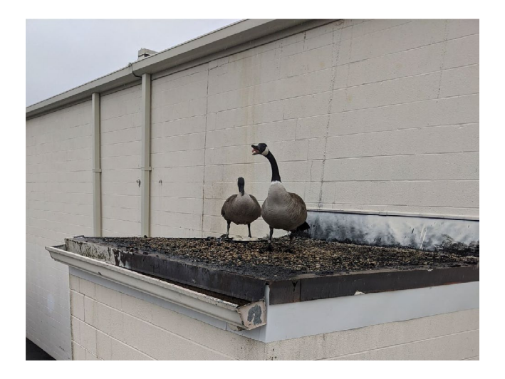
FIGURE 2 Nesting pair of Canada geese ( Branta canadensis ) defending an elevated nest. Note that the nest is composed of atypical materials of rock and a rubber automotive belt with little to no down/body feathers

The first nest (Figure 1) was discovered on 20 April 2021 in Speedway, IN, on a hotel building that had a 1.2-meter tall safety wall around the perimeter of the roof. The second nest (Figure 2) was discovered on 27 March 2021 in Greenfield, IN. This site was used twice in the 2021 field season by two different females. As such, we treated this as our third observation of the focal behavior (Figure 3). The females of this nesting site were differentiated due to their unique tarsal bands. The fourth nest (Figure 4) was discovered on 15 April 2021 in Southport, IN. The fifth nest (Figure 5) was discovered on 25 May