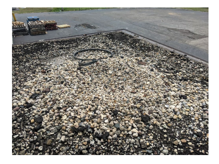
FIGURE 3 Rooftop Canada goose ( Branta canadensis ) nest posthatch. Note the automotive belt that was used as a "liner" in Figure 2 was moved and instead a shallow depression in gravel was used as the nest for the second time in the 2021 season