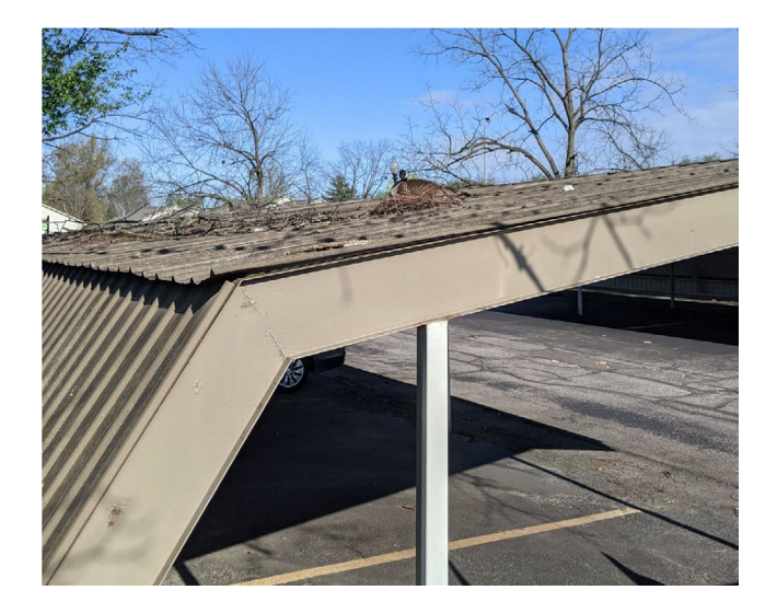
FIGURE 4 Nesting female Canada goose ( Branta canadensis ) incubating an elevated nest located on top of a carport roof in Southport, IN. Nest was composed of traditional nesting material, mainly leaf litter and twigs