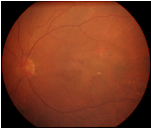
Figure 3 Submacular hemorrhage of case 3 post treatment.

cases only in one of the three patients was a PED present before the treatment (case 1). In that case the area involving the PED was 8.07 mm 2 (Figure 1).