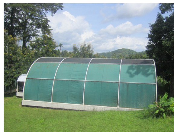
Figure 1 A picture of Semifield structure.

The semi field structure environment has been constructed to mimic local, outdoor conditions [20]. The semi field structure has a dimension of 12.2 m long and 8.2 m wide (Figure 1), allowing wind flow, precipitation and creating similar climatic conditions to ambient conditions. Entrance into the sphere is through a double door system; a wooden door provides entrance to the sphere, after passing through a small corridor (3.0mlong and 2.2 m wide) covered with plastic transparent roofing material, with a screened door to the outside. This prevents escape of released mosquitoes and entry of wild mosquitoes. There is some vegetation grown in semifield structures to mimic the natural land cover. Semi field protocol was used as described in WHO manual [19]. The same dosages used in the laboratory were used in semi field. The main difference with laboratory trials, in semifield the microcosm was exposed to sunlight and night weather without control of any parameter such