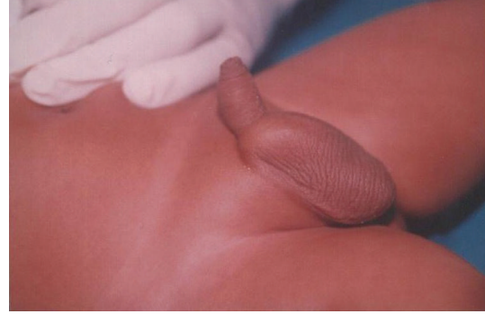
FIGURE 3: Clinical photograph of the second patient showing a diverticulum at the penoscrotal junction.