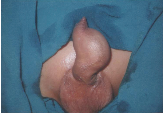
FIGURE 1: Clinical photograph of the first patient showing a large diverticulum in the anterior urethra.