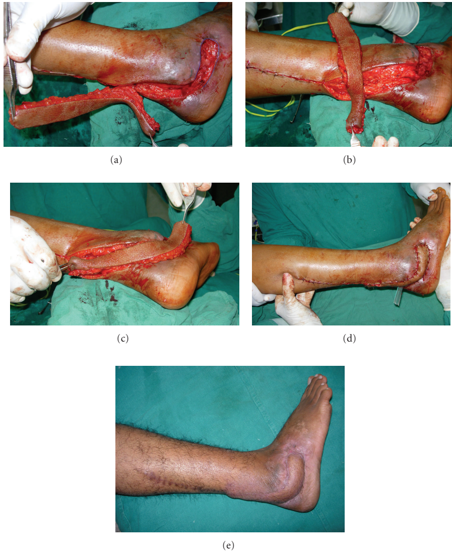
FIGURE 2: (a) Soft-tissue defect near lateral malleolus with peroneal tendons injury and infection. Surrounding skin is inflamed. Defect is marked. (b) Flap islanded on a single perforator and rotated to 90 degree. (c) Propeller flap completely rotated to 180 degree. (d) Flap inset preoperatively. (e) Postoperative result after 15 months.

demands microsurgery facility and expertise [12–14]. Fasciocutaneous flap from the same leg to reconstruct defect around ankle region is less preferred due to its morbidity as donor area always requires skin graft and bulky dog ear, which is unappealing. Distally based superficial sural artery flap is a good alternative to reconstruct distal leg defects. The sural nerve is not important for vascularization of the distally based superficial sural artery flap and can be spared during flap elevation [15–17].