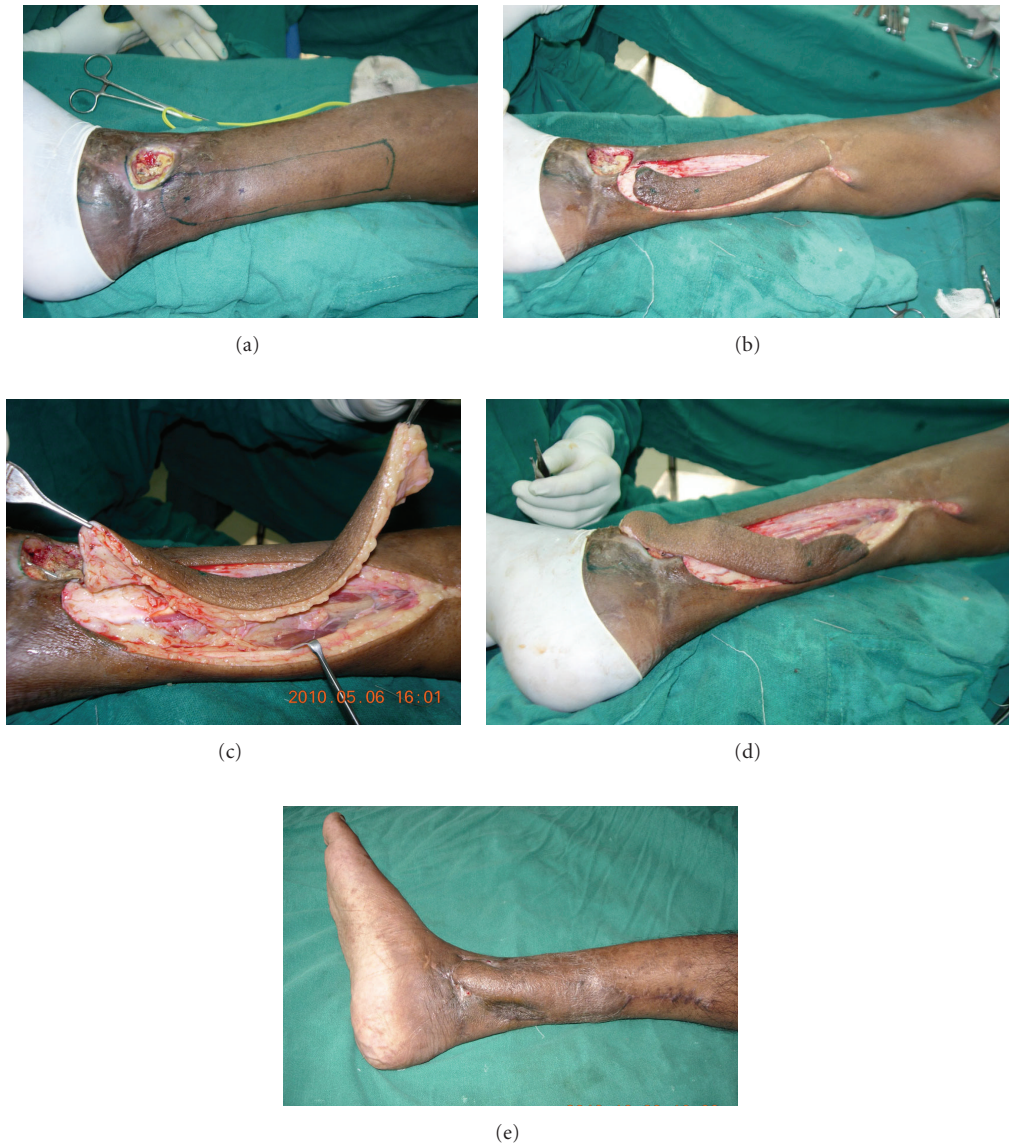
FIGURE 3: (a) Soft-tissue defect with exposed medial malleolus and implant. (b) Flap islanded around the perforator of posterior tibial artery. (c) Flap lifted up on a single perforator. (d) The propeller flap is rotated to 180 degree and placed over the defect. (e) Result after 2 months of surgery. Marginal dehisence of wound over inferior part of defect managed with small split skin graft.

The morbidity of the donor site was minimized due to primary closure of donor site.