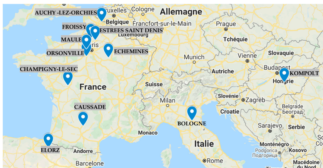
Figure 1. Locations where the experimental trials were carried out two consecutive growing seasons (2015 and 2016; Caussade has been excluded from the study).

Ten experimental sites were identified by the breeders based on the quality of the results regularly observed at these locations, with the aim of maximizing the sources of variability in the expression of breadmaking quality.