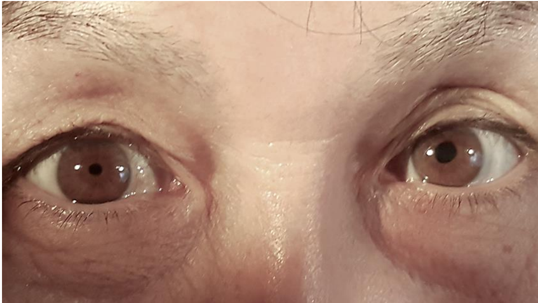
Fig. 1. The patient has a tonic pupil on the right side, and pupillary examination showed anisocoria, with the right pupil being smaller than the left one.