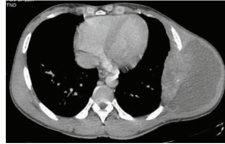
FIGURE 4: Axial Computed Tomography image at lesion level in mediastinal window showing well loculated hypodense collection in the left chest wall with peripheral enhancement.

Fine needle aspiration from swelling was done and yielded pus. Aerobic bacterial culture of the pus was sterile