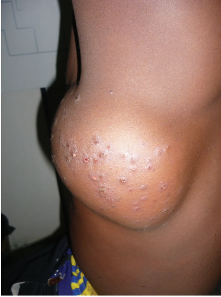
FIGURE 1: Showing large solitary well defined swelling with pustules on the skin on left chest wall over 5th to 8th ribs area.