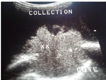
FIGURE 3: Ultrasonography showing hypoechoic lesion with dense internal echoes and destruction of rib.

lung parenchymal lesion (Figure 6) or mediastinal lymphadenopathy; the abdomen was within normal limits.