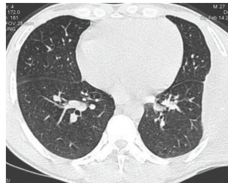
FIGURE 5: Axial Computed Tomography image at lesion level in lung window showing no evidence of lung parenchymal lesion.