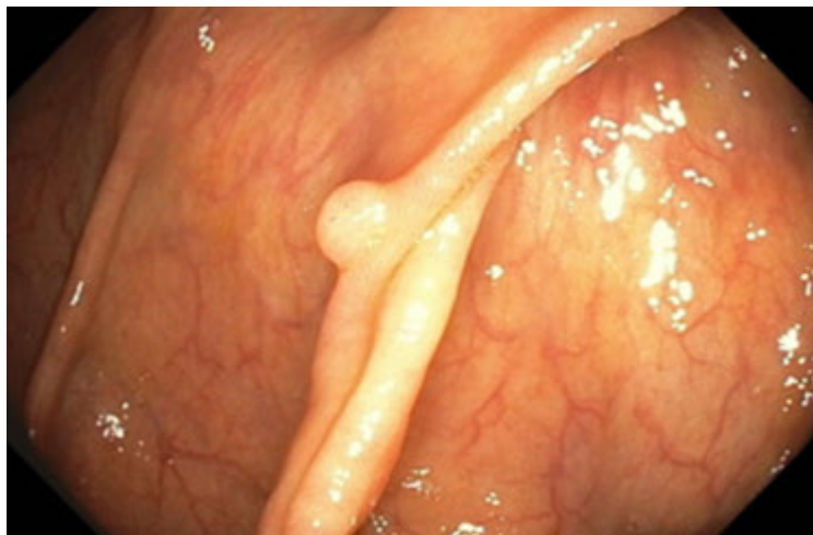
Figure 1. Colonoscopy showing a sessile 3 mm polyp in the rectum.