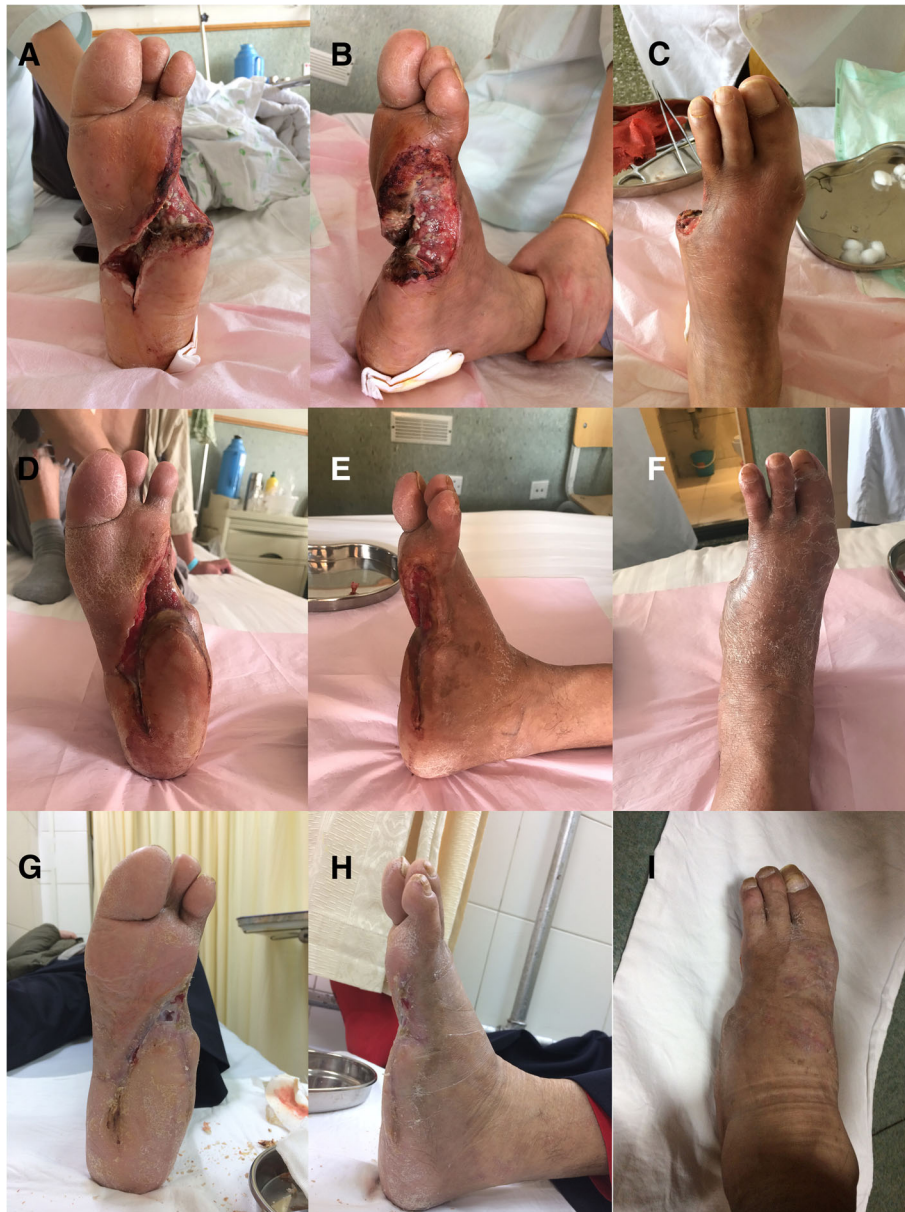
Fig. 5 Follow-up of the surgical intervention and outcomes. abc: 25/7/2017. def: 30/9/2017. ghi: 19/11/2017

treatment to reduce adverse effects on the body. In combination with standard treatment, conditions for amputation should be achieved in as expedient a fashion as possible. Multi-disciplinary cooperation and optimization of the treatment schedule are necessary if there is even a remote possibility of preserving any portion of the foot or toes.