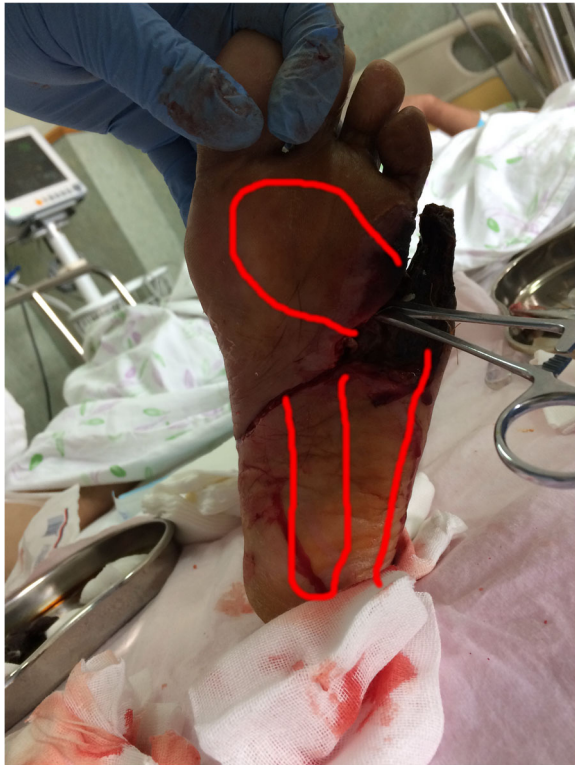
Fig. 3 Subcavities found in the left foot. 20/7/2017

through debridement and healing [10]. Such treatment should be initiated once the local infection is restricted, and the patient is stable. However, after the intervention, improved wound circulation increases the inflammatory response. In this case, the patient underwent substantial debridement during thrombolysis, when it was discovered that the infection had spread along physiological lacunae (Figs. 3 and 4). Blood supply to the lower extremities was not considered sufficient for skin grafting.