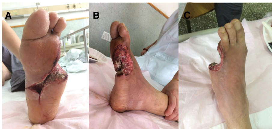
Fig. 4 Results of patella truncation and debridement. abc: 24/7/2017

The treatment of diabetic foot ulcers is extremely complicated. During the initial stages of diagnosis, a multidisciplinary team should make treatment recommendations based on the severity of ischemia and the degree of infection. If the foot cannot be preserved, thorough debridement may be performed during the initial stages of