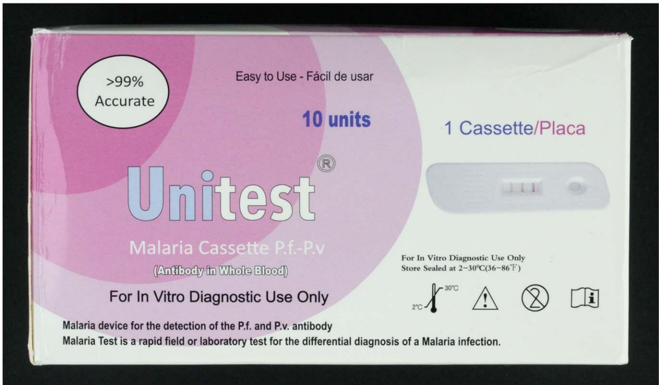
Figure 1. Received product of Unitest (Ciriano global S.L., Zaragoza, Spain). The delivered Unitest malaria cassette P.f.v kit mentions detection of antibodies while the almost identical kit on the website mentions detection of the Pf and Pv antigen. ( http://www.clinica.co.za/index.php?page=shop.product_details&flypage=flypage.tpl&product_id=11&category_id=3&option=com_virtuemart&Itemid=90 ). doi:10.1371/journal.pone.0053102.g001

Median Flesh Kincaid grade level was 8.32 (5.86–9.65), only Immunoquick had a Flesh Kincaid grade level ≤6 th grade.