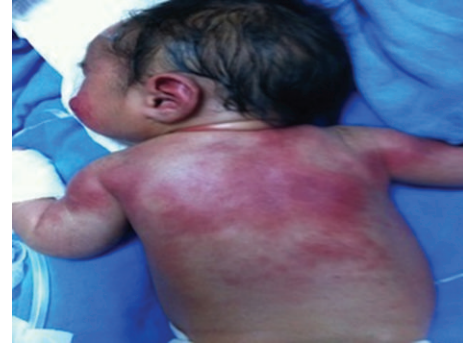
FIGURE 1: Macroscopic appearance of SCFN in our patient.

Hypoglycemia is another risk factor that has been reported in association with SCFN. However, whether it is