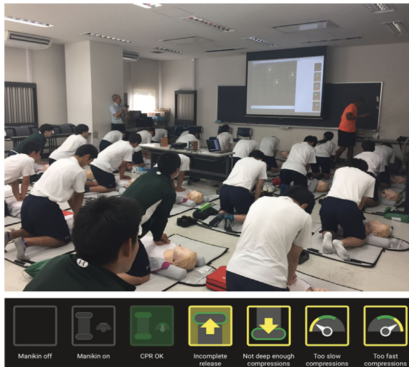
Fig. 2. Photograph of a class participating in school-based cardiopulmonary resuscitation (CPR) training and Quality CPR icons