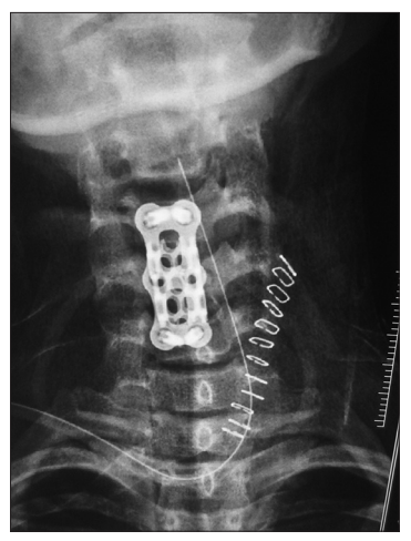
Figure 2: Immediate postoperative anteroposterior view after corpectomy C5 vertebra

All cases were followed up for 12–42 months (mean 27 \pm 8 months). The mean age was 41.8 \pm 15.25 years (range, 15–88 years). The study group consisted of 82 male and 17 female patients. The most common mode of trauma was fall from the height, i.e., 66.7% followed by roadside accident 33.3%. Of 99 patients, preoperatively, three patients had ASIA B neurology, 21 patients had ASIA C neurology, 41 had ASIA D neurology, 34 patients had ASIA E neurology, and postoperatively, one patient had ASIA B neurology,