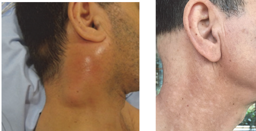
FIGURE 3: Complete clinical response of a cutaneous melanoma metastatic cervical lymph node conglomerate that developed during systemic therapy with nivolumab and ipilimumab, two months following irradiation with 12 x 3 Gy with 6MV over 3 weeks, combined with twice-weekly superficial hyperthermia.

necrotic melanoma cells as compared with irradiation alone [29]. Several meta-analyses have shown the superiority of hyperthermia as a radiosensitiser in other solid tumour types, frequently more efficient than classical chemotherapy and with considerably less toxicity [30–32].