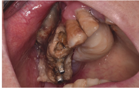
FIGURE 1: Patient's preoperative clinical condition: necrotic bone exposure and purulent exudate in quadrant I.