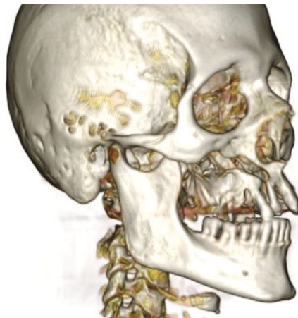
FIGURE 2: Three-dimensional reconstruction of CT scans that highlighted the detachment of the right hemimaxilla.