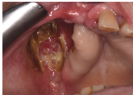
FIGURE 4: Patient's clinical condition at 2-month follow-up visit: persistence of oroantral communication and presence of mucus.